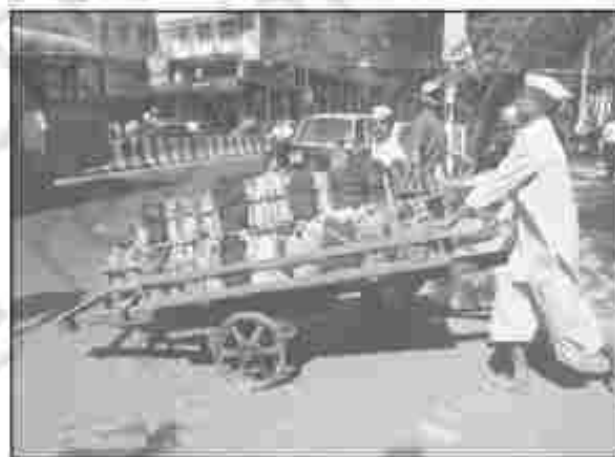
Fig. 6.4: Dabbawala Service in Mumbai

Personal services are made available to the people to facilitate their work in daily life. The workers migrate from rural areas in search of employment and are unskilled. They are employed in domestic services as housekeepers, cooks, and gardeners. This segment of workers is generally unorganised. One such example in India is Mumbai's dabbawala (Tiffin) service provided to about 1,75,000 customers all over the city.