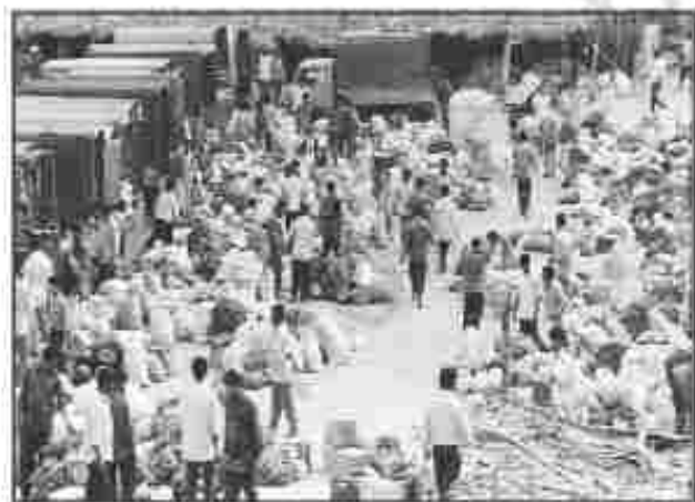
Fig. 6.2: A Wholesale Vegetable Market

Rural marketing centres cater to nearby settlements. These are quasi-urban centres. They serve as trading centres of the most rudimentary type. Here personal and professional services are not well-developed. These form local collecting and distributing centres. Most of these have mandis (wholesale markets) and also retailing areas. They are not urban centres per se but are significant centres for making available goods and services which are most frequently demanded by rural folk.