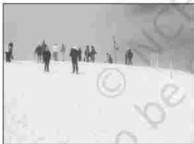
Fig. 6.5: Tourists skiing in the snow capped mountain slopes of Switzerland

Tourism is travel undertaken for purposes of recreation rather than business. It has become the world's single largest tertiary activity in total registered jobs (250 million) and total revenue (40 per cent of the total GDP). Besides, many local persons, are employed to provide services like accommodation, meals, transport, entertainment and special shops serving the tourists. Tourism fosters the growth of infrastructure industries, retail trading, and craft industries (souvenirs). In some regions, tourism is seasonal because the vacation period is dependent on favourable weather conditions, but many regions attract visitors all the year round.