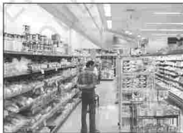
Fig. 6.3: Packed Food Market in U.S.A.

Urban marketing centres have more widely specialised urban services. They provide ordinary goods and services as well as many of the specialised goods and services required by people. Urban centres, therefore, offer manufactured goods as well as many specialised markets develop, e.g. markets for labour, housing, semi or finished products. Services of educational institutions and professionals such as teachers, lawyers, consultants, physicians, dentists and veterinary doctors are available.